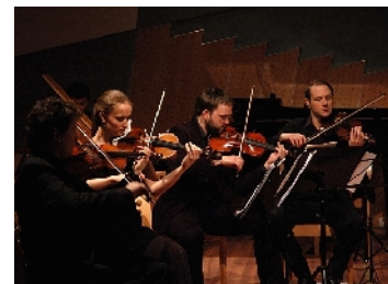
Image2 string section