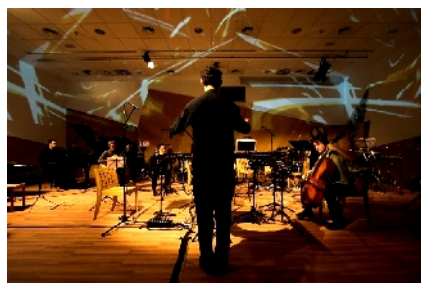
free style hermes, Vienna